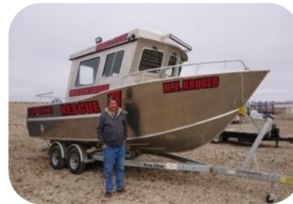
Canadian Coast Guard Auxiliary