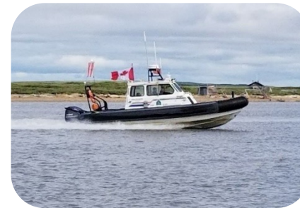
Royal Canadian Mounted Police