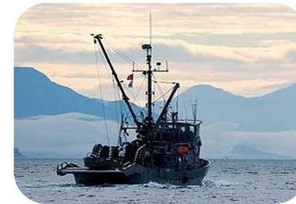
Vessels of Opportunity