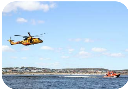
Provincial & Territorial SAR Assets