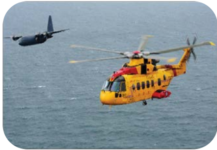
Royal Canadian Air Force