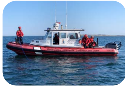
CCG Arctic Marine Response Station