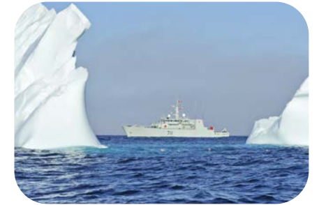
Royal Canadian Navy