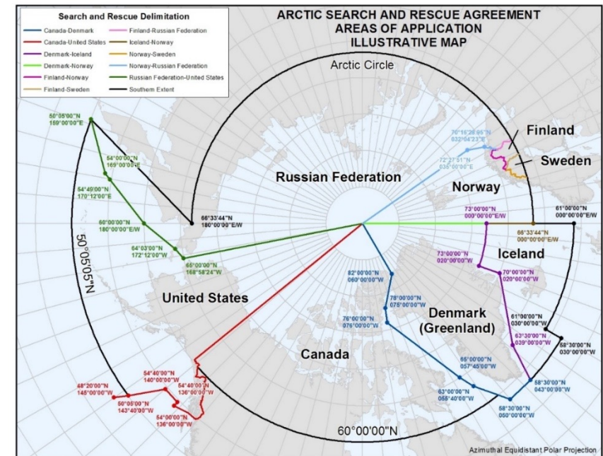
Arctic SAR Agreement Boundaries